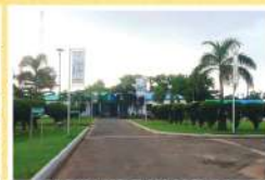
MARKETING OFFICE ENTRY