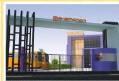
SHEMFORD FUTURISTIC SCHOOL