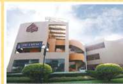
BRIDDHI SHOPPING COMPLEX