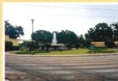
ENTRY GATE 2

WELCOME TO AN INTEGRATED TOWNSHIP WHERE AMENITIES AND GREENERY LIVE IN PERFECT HARMONY. A PLACE WHERE DREAMS TAKE SHAPE AND WISHES ARE LIVED. SPREAD OVER TOWNSHIP A SPRAWLING 224-ACRE, THIS IS A PLACE WHERE YOU DON'T LIVE, IT IS A PLACE WHERE YOU COME ALIVE.