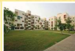
GROUP HOUSING GROUND