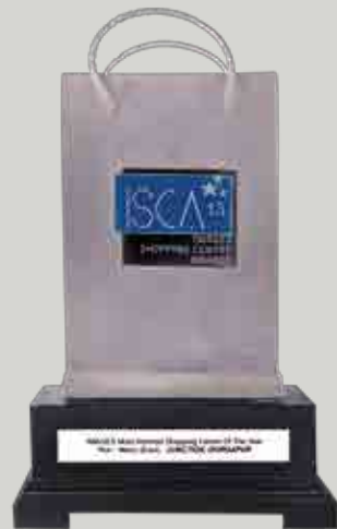
Junction Mall won IMAGES Most Admired Shopping Centre of the Year, Non-Metro East in 2013.