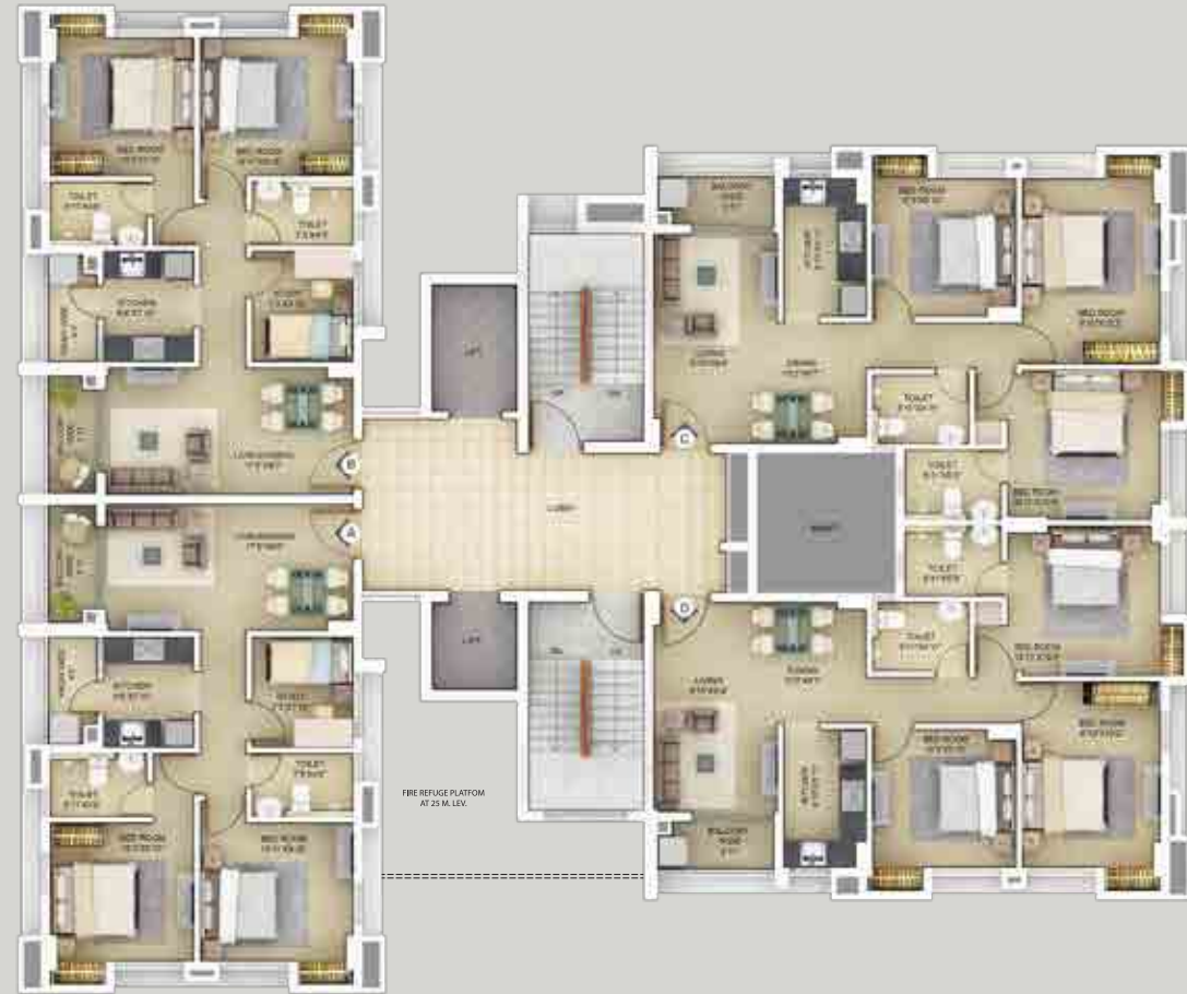
BLOCK 1 - TYPICAL FLOOR PLAN (2ND TO 12TH FLOOR)