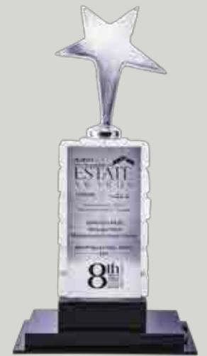
Junction Mall won Best Project in Non-Metro East at the 8th Real Estate Award by Franchise India in 2015.