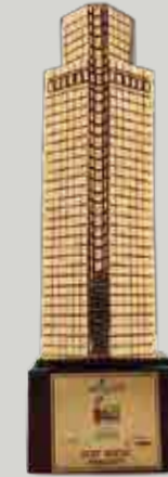
ASTITVA won the CREDAI Bengal Realty Award for 'Best Green Project in Eastern India' in 2015.