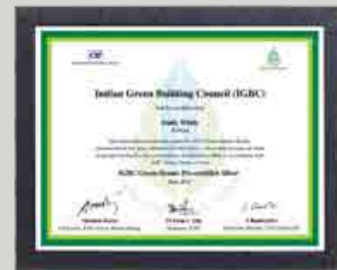
IGBC has Pre-Certified SOUTHWINDS at Southern Bypass, Kolkata as a 'Silver Rated' Green Residential Building in 2015.