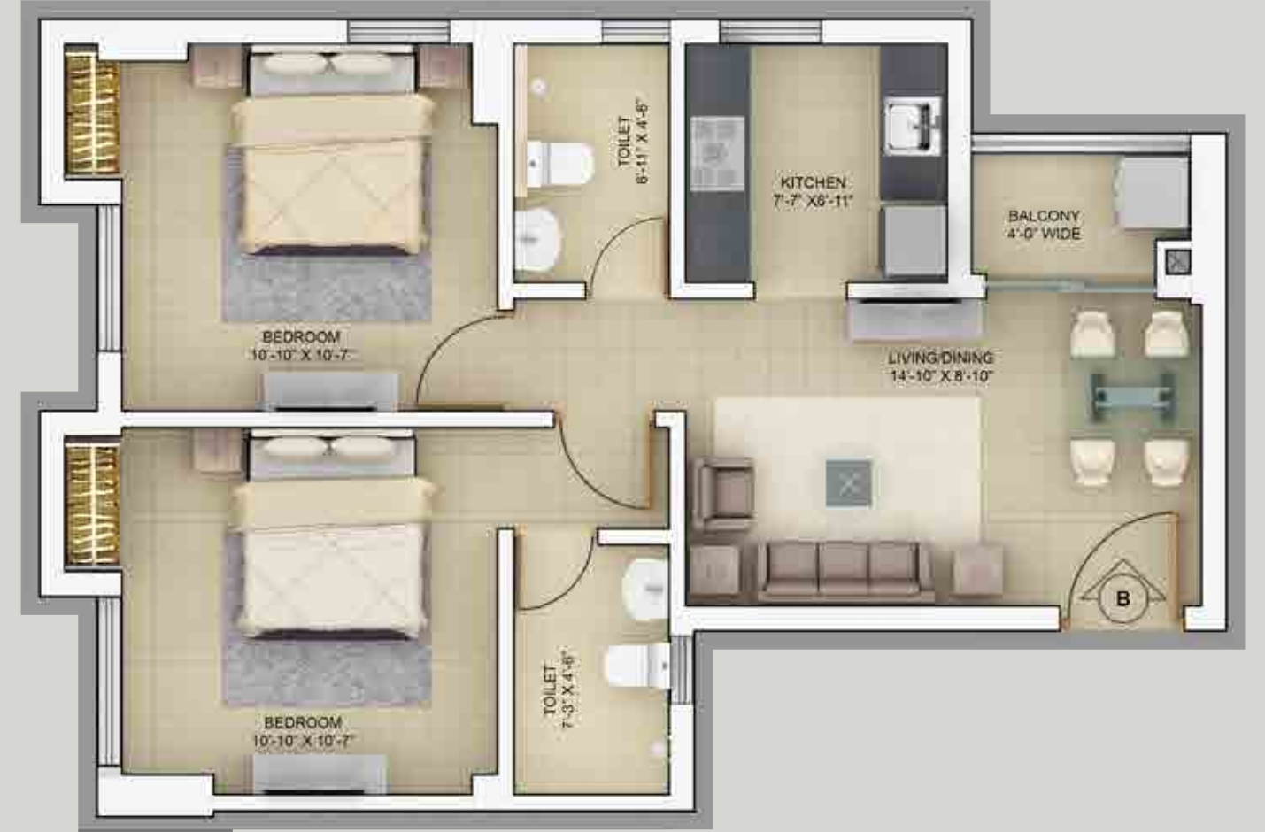
BLOCK 3 (2nd - 12th FLOOR)