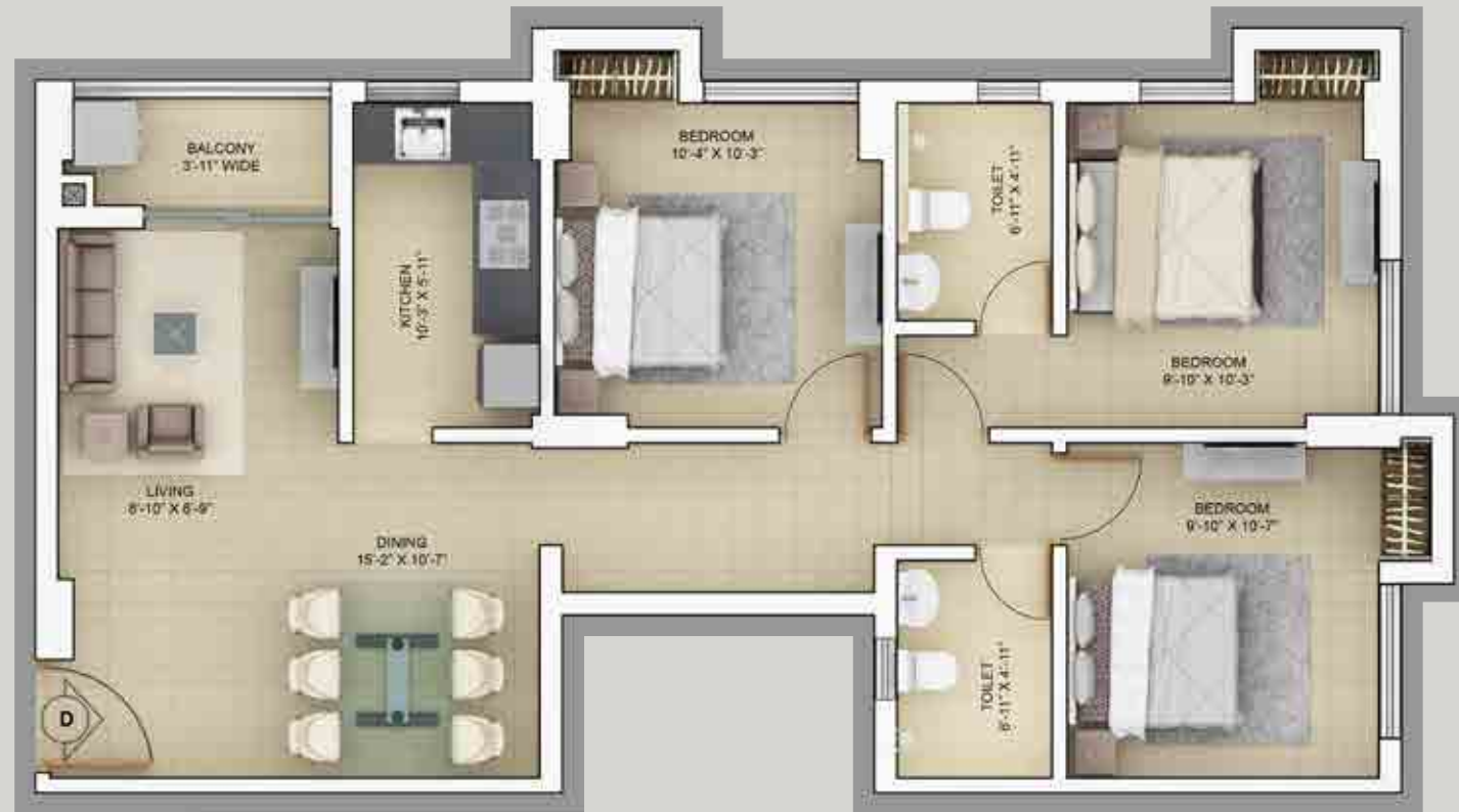
BLOCK 2 (2nd - 12th FLOOR)