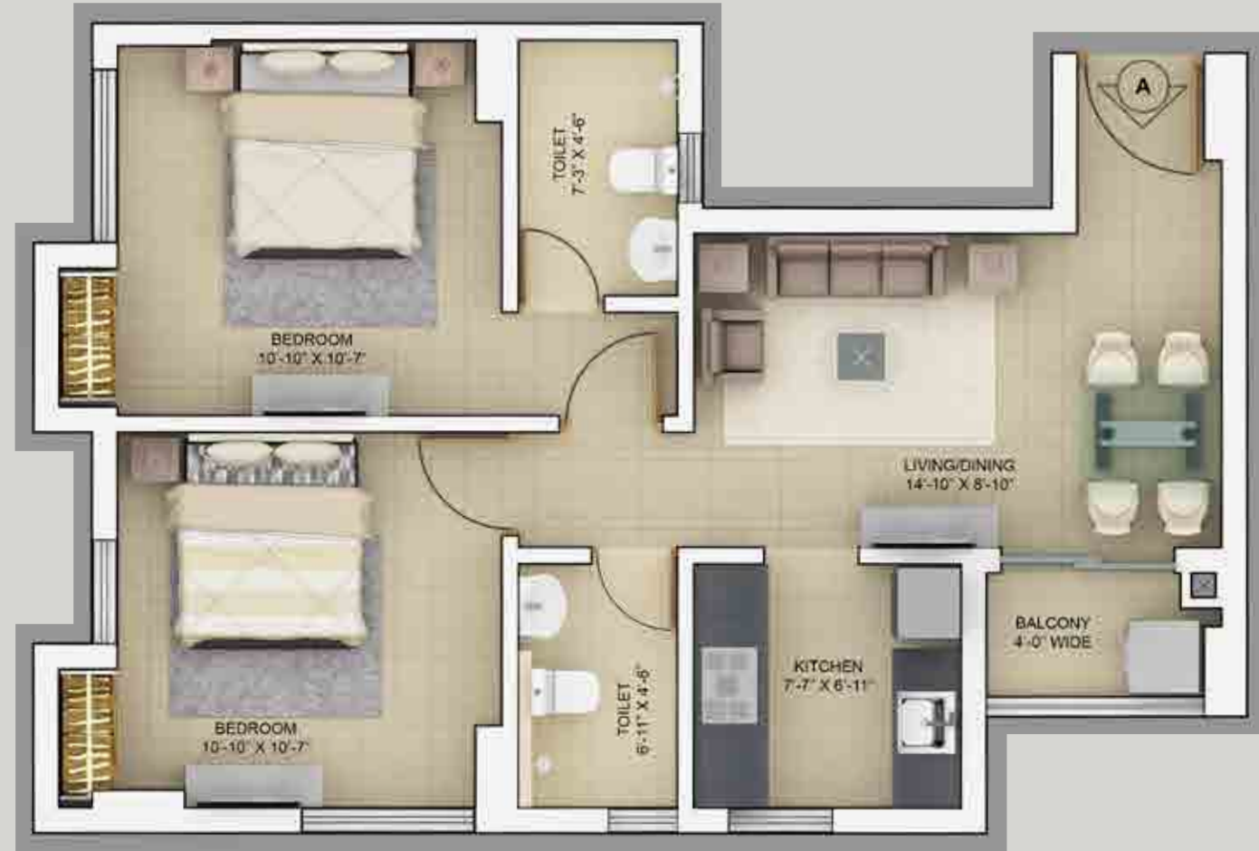
BLOCK 3 (2nd - 12th FLOOR)