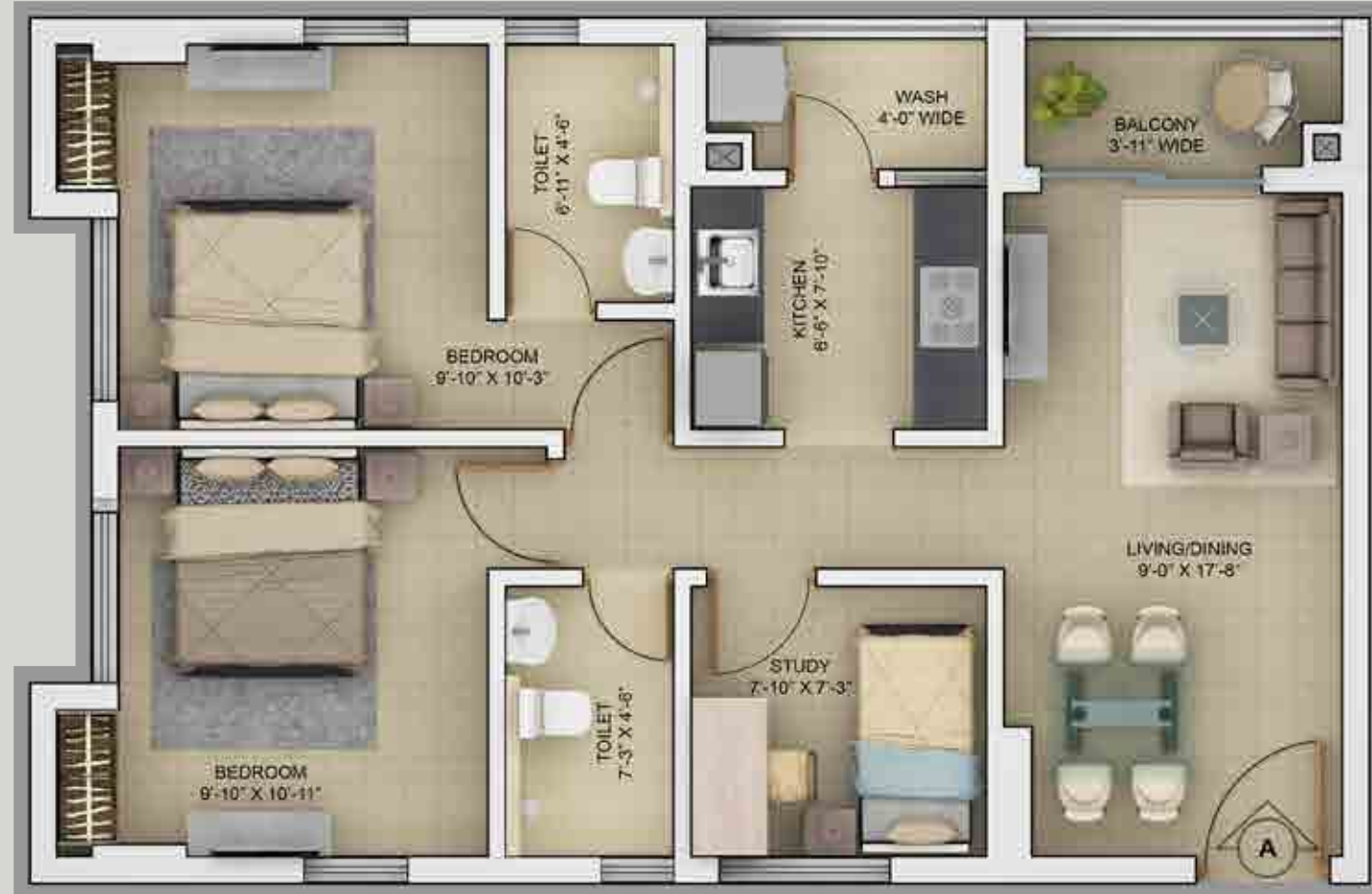
BLOCK 2 (2nd - 12th FLOOR)