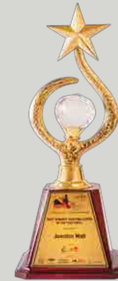
Junction Mall won Asia Africa GCC Retail and Shopping Centre Awards for the Most Admired Mall in East in 2016.