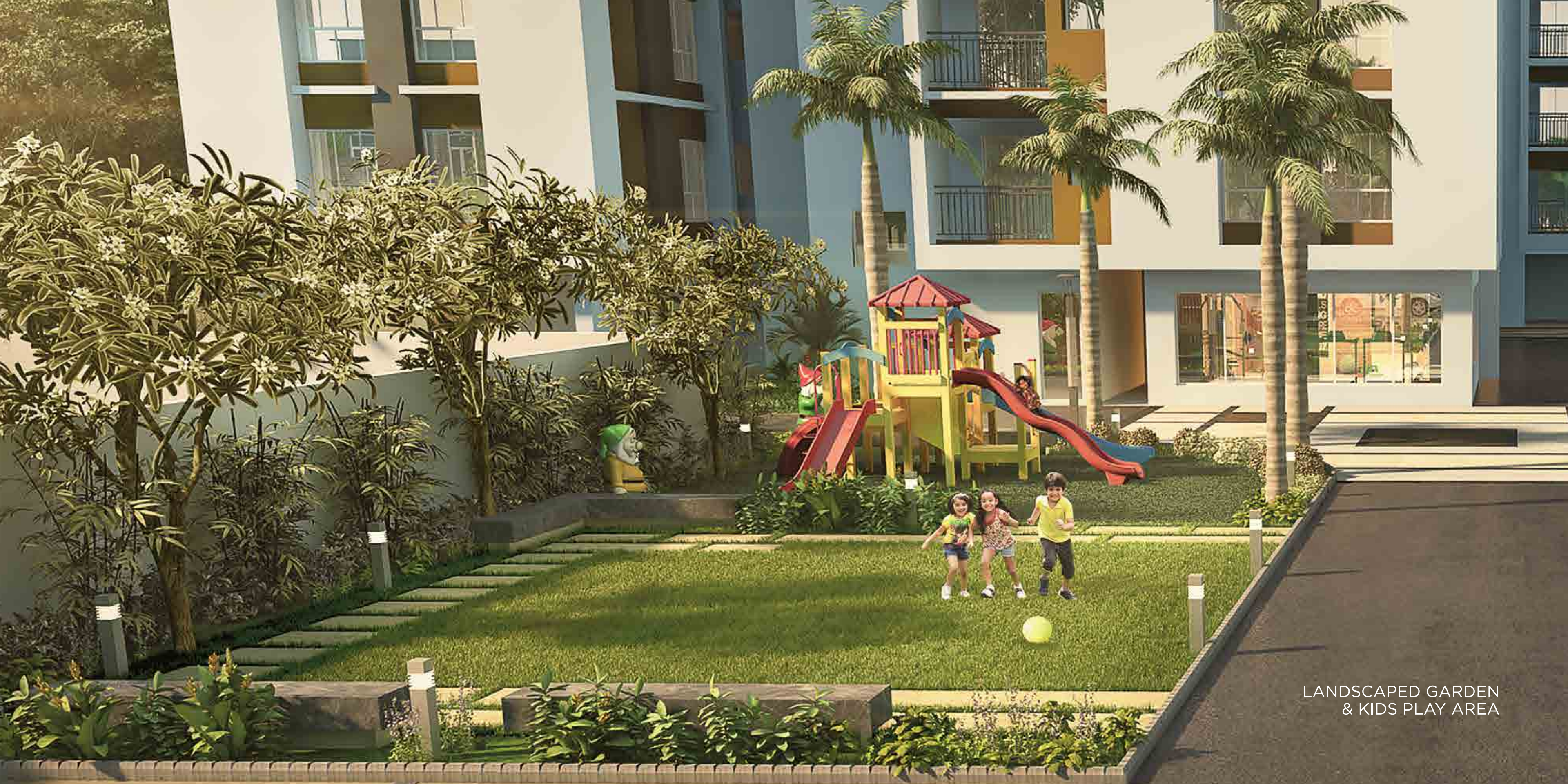
LANDSCAPED GARDEN & KIDS PLAY AREA