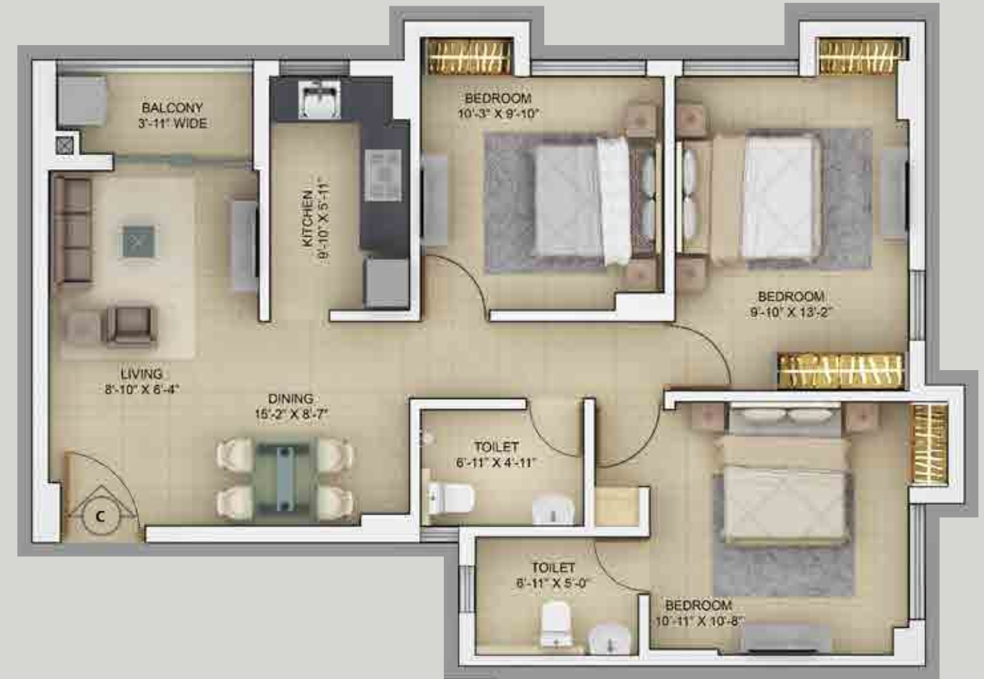
BLOCK 1 (2nd - 12th FLOOR)