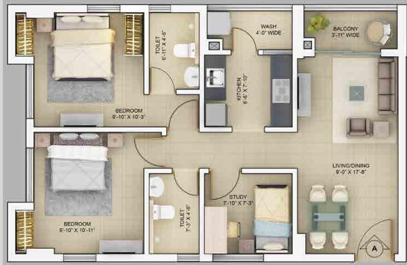
BLOCK 1 (2nd - 12th FLOOR)