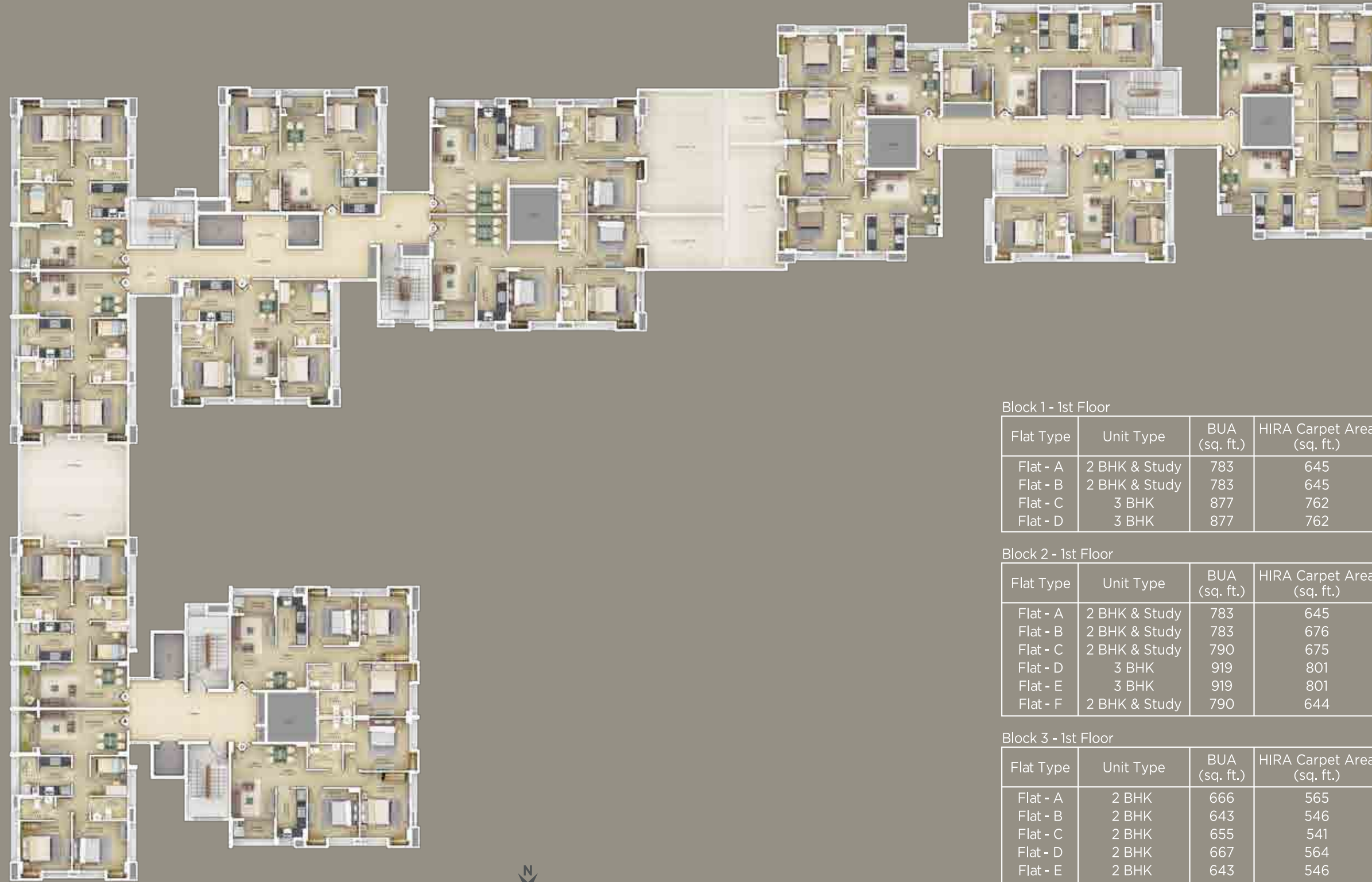
Block 1 - 1st Floor