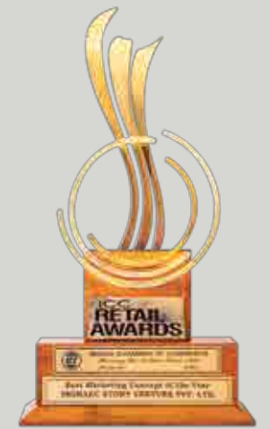
STORY has won the 'Best Marketing Concept of the Year' award at the Indian Chamber of Commerce Retail Awards 2015.