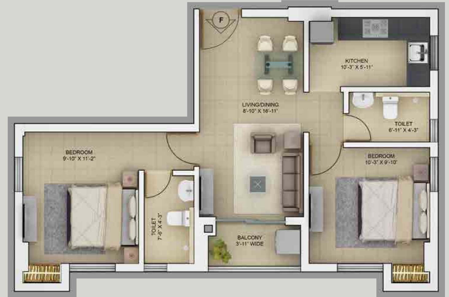
BLOCK 3 (2nd - 12th FLOOR)