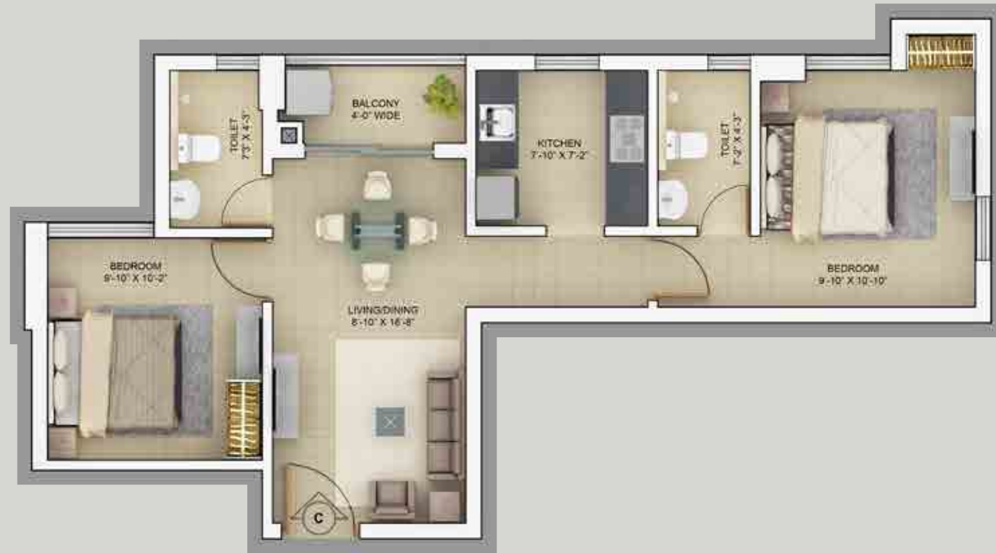
BLOCK 3 (2nd - 12th FLOOR)