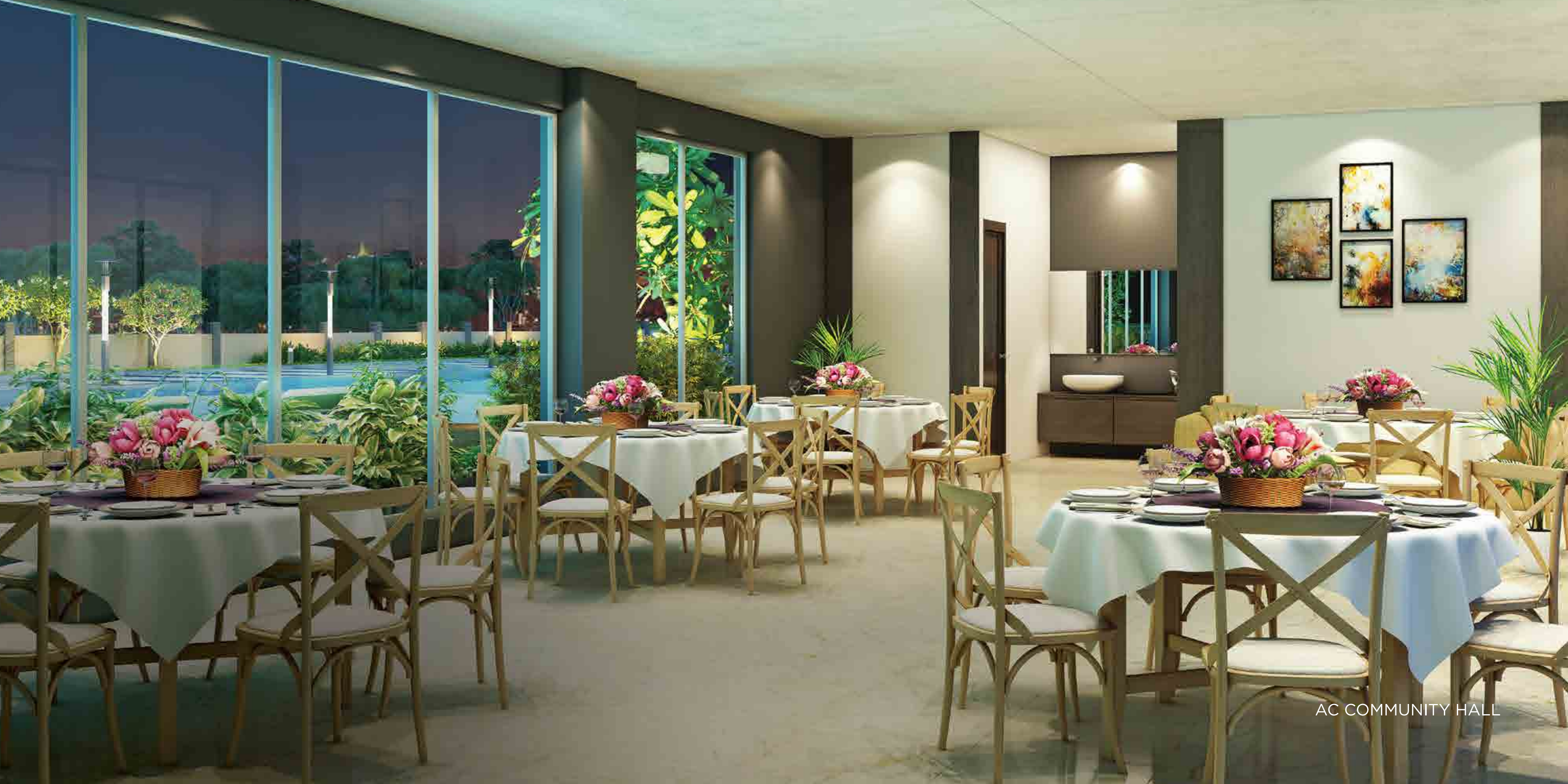
AC COMMUNITY HALL