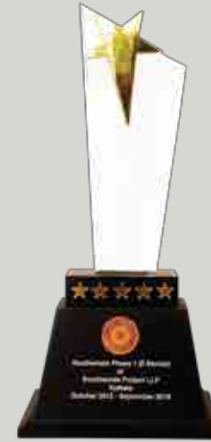
CRISIL has awarded SOUTHWINDS (Phase I) with 5 star ratings, under the real estate category in the FY 2015-16.