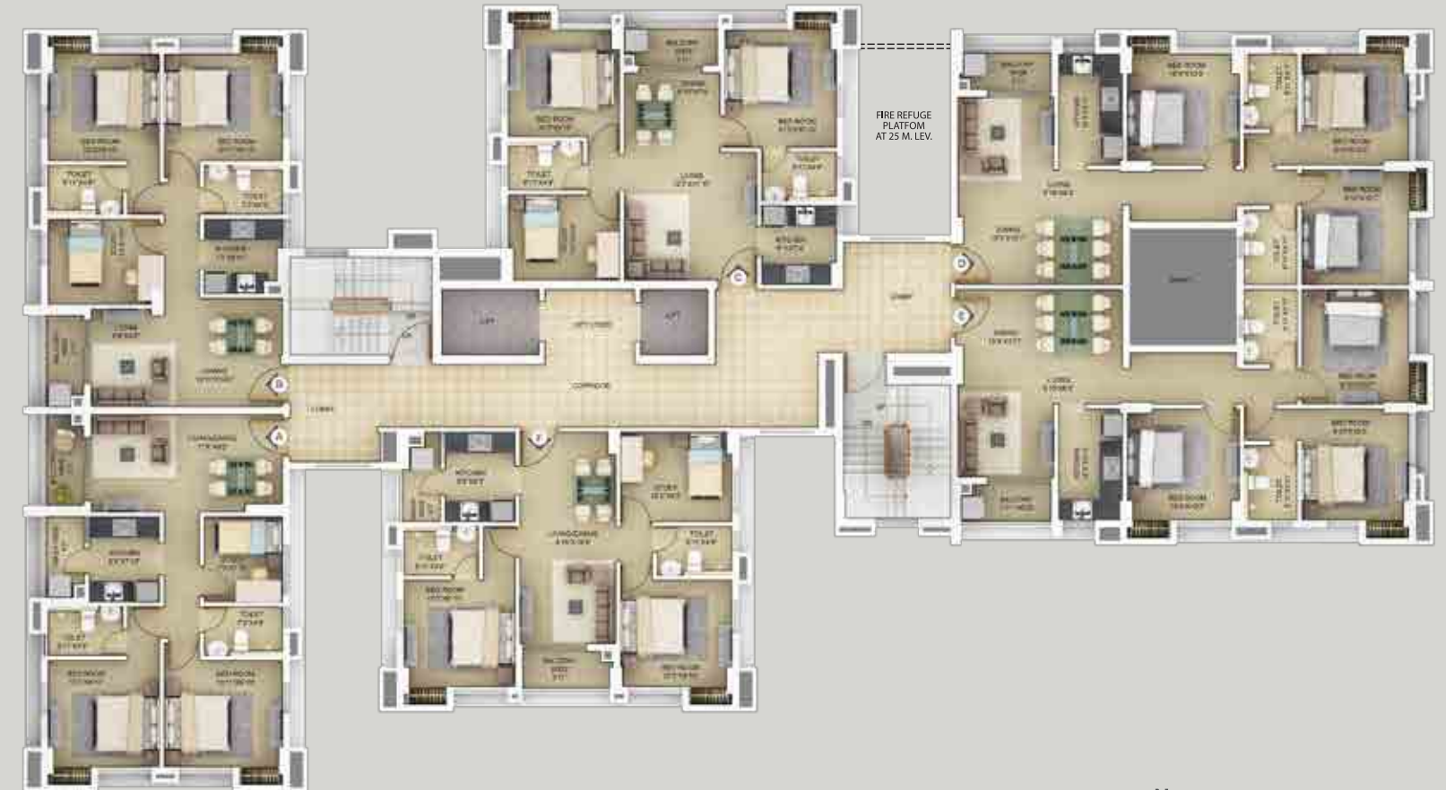
BLOCK 2 - TYPICAL FLOOR PLAN (2ND TO 12TH FLOOR)