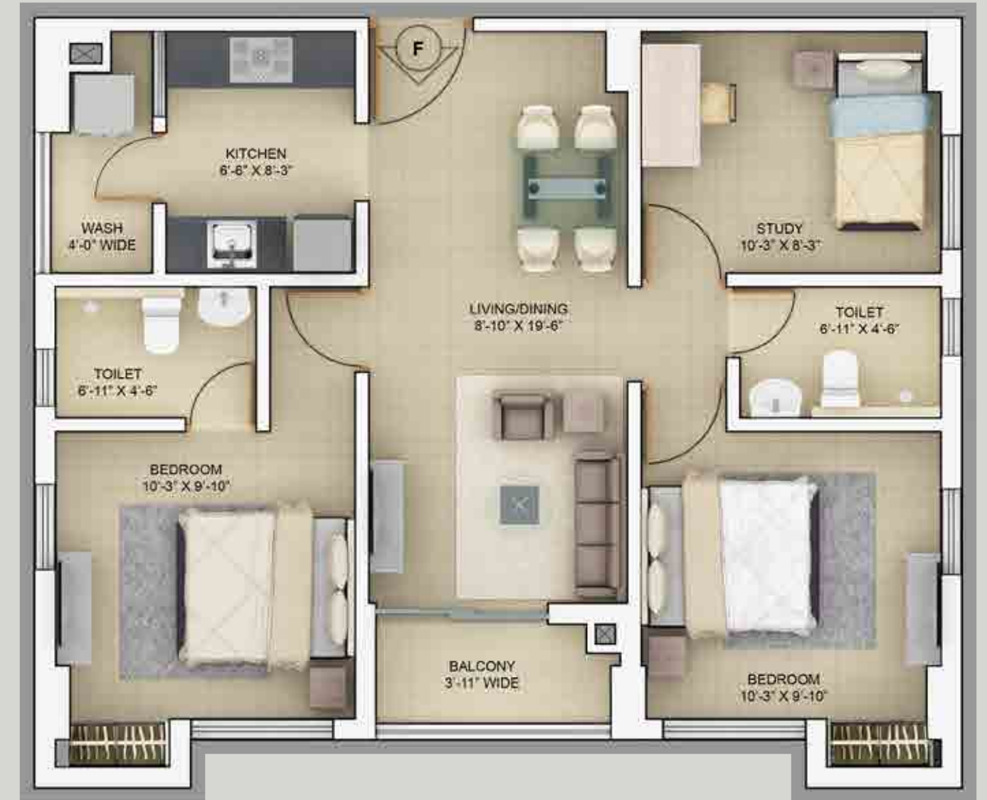
BLOCK 2 (2nd - 12th FLOOR)