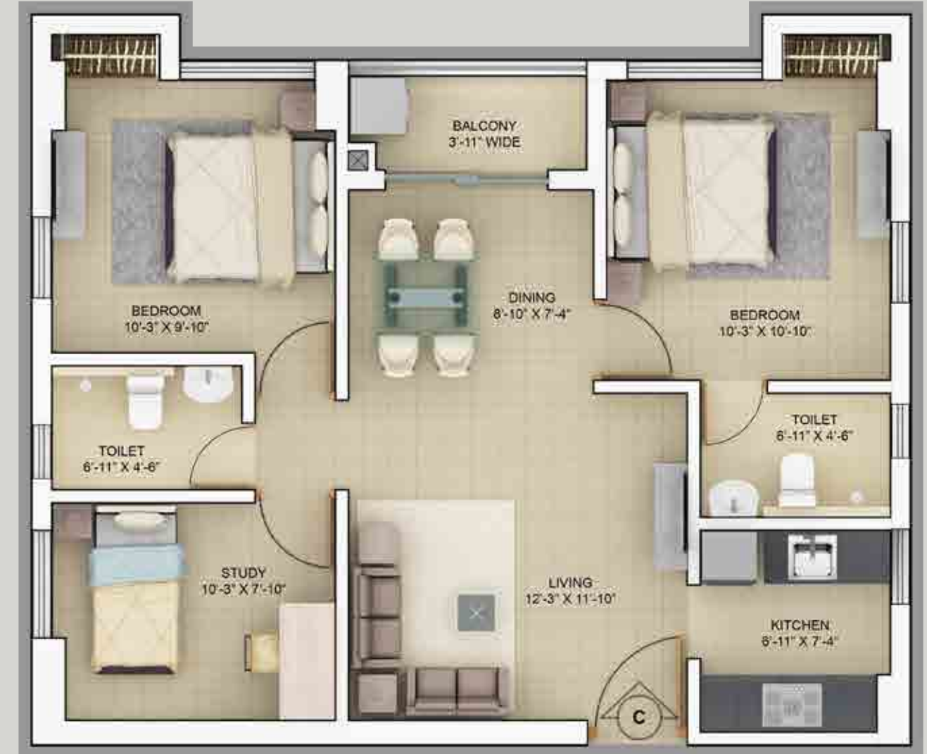
BLOCK 2 (2nd - 12th FLOOR)